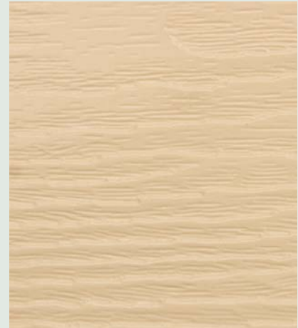
Close up of the woodgrain effect

Fortex® comes with significant environmental credentials: The Building Research Establishment's Green Guide to Specification recently gave PVC cladding the top A+ rating, when installed with standard products or materials.